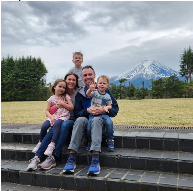
We shared good fellowship at our annual field team gathering

This past month we were busy with kids' schooling changes and a visit from Canada. Andrew's parents flew in from Ontario to make their first visit to Japan. Highlights of our time together include a trip to Kyoto, a balloon battle, and many hours spent reading books with Grandpa. Tears were shed at the airport as the kids waved goodbye and blew kisses. The same week, we celebrated Resurrection Sunday with our Japanese brothers and sisters at Saikyo Nozomi Chapel. While our neighbours politely declined our invitations, we saw other new faces when our church met for worship. During the service, we broke off into groups and shared our testimonies. We were encouraged to hear the different ways in which others were drawn to God in a country where the vast majority of people have not heard the Gospel. Through their stories, God's sovereignty in salvation was clearly demonstrated to us.