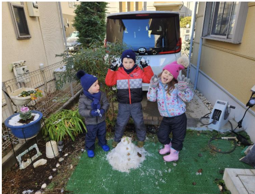
The kids gathered all the snow they could find to make a "snowman"